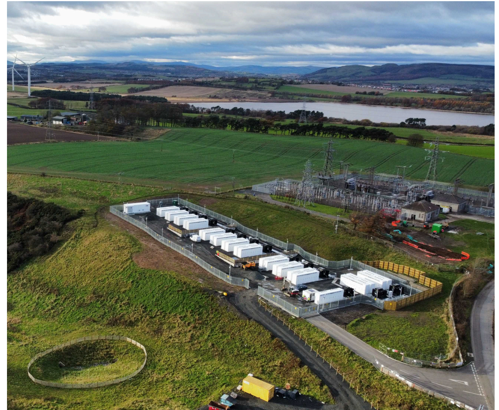
Little Raith, 49.5 MW / 99 MWh, Lochgelly

Traceability systems allow BESS developers to map each BESS product's supply chain from mine to manufacture, capturing regional, company and manufacturing data along the supply chain, and identifying high-risks areas and incidents many tiers deep into the value chain.