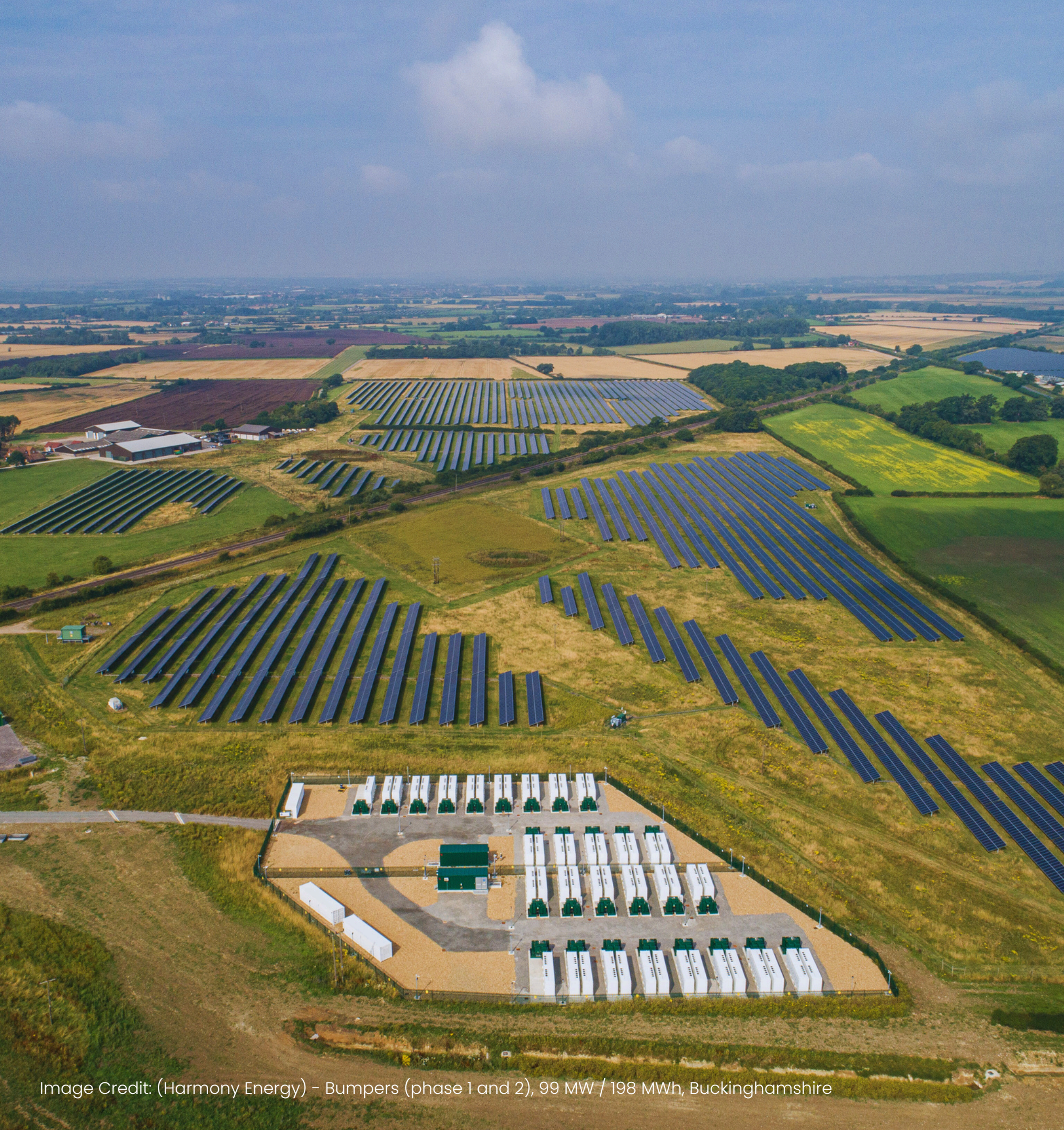
Bumpers (phase 1 and 2), 99 MW / 198 MWh, Buckinghamshire